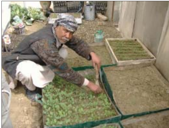
A worker with MAIL preparing vegetables for transplanting.

FARMS continues to use the proceeds to develop Afghanistan’s agricultural economy.