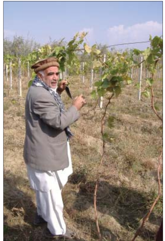
An Afghan man inspects grapes at a research station near Kabul, Afghanistan.