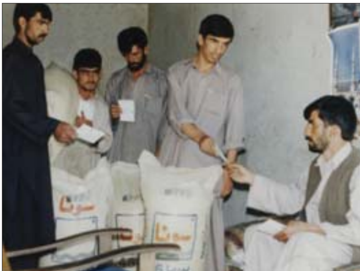
A trained agri-input dealer sells fertilizer to farmers.