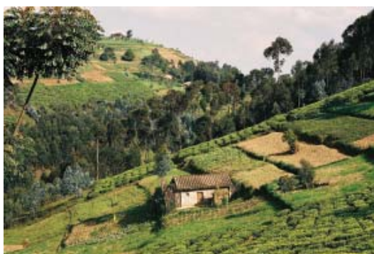
The project will help maintain biodiversity, intensify farm production, and develop markets.

relicts of parks and reserves, including habitats of mountain gorillas and other endangered wildlife and plants.