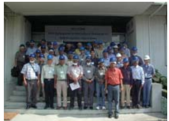
Participants wore hard hats during a visit to the Thai Central Chemical Public Company near Bangkok.

IFDC has organized more than 670 workshops, study tours, and training programs for about 9,000 participants from 150 countries since 1974. The programs have included fertilizer