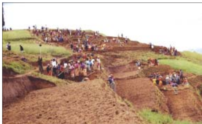
Local people will be mobilized in labor-intensive public works such as building terraces and roads and planting trees.

"Agricultural markets are underdeveloped and fragmented in the Great Lakes region," Bumb says. "The project will strengthen markets for agricultural inputs and outputs by providing training for agri-input dealers and farmers' organizations. We'll also encourage partnerships between the public