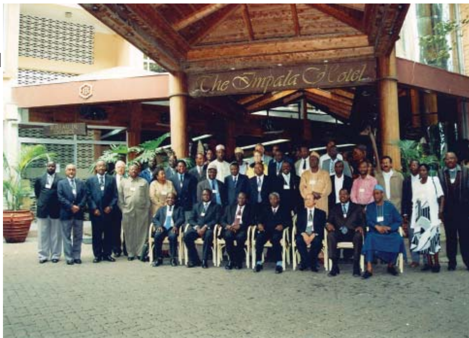
Participants at the workshop on Challenges in Developing Agricultural Input Markets in Africa.

cluded that the private sector must lead in the development of agro-input markets, with governments providing a supporting market environment,” Bumb said. “They called for removal of tariffs and taxes on inputs, capacity building for producer organizations, development of input dealer networks, improved access to credit, policy incentives, and regional integration and harmonization.”