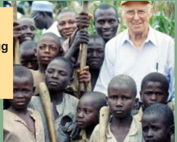
Nobel Laureate Norman Borlaug in a field with African children.

Texas A&M University established the Norman E. Borlaug Institute for International Agriculture in September 2006. The new institute replaces Texas A&M’s Office of International Agriculture.