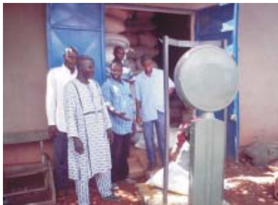
Teaching correct weight control in Burkina Faso.

The Fertilizers and Sustainable Agricultural Development (F&SAD) project aims to improve access to and efficient use of agricultural inputs, particularly fertilizers, in West Africa. The project is funded by the International Fertilizer Industry Association (IFA) and USAID and coordinated by IFDC's From